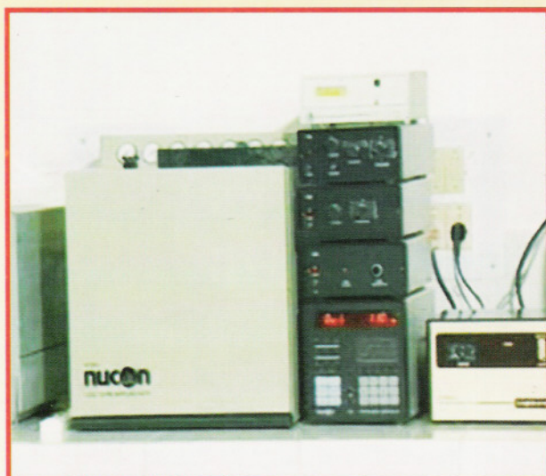
Chromatography Of Oil