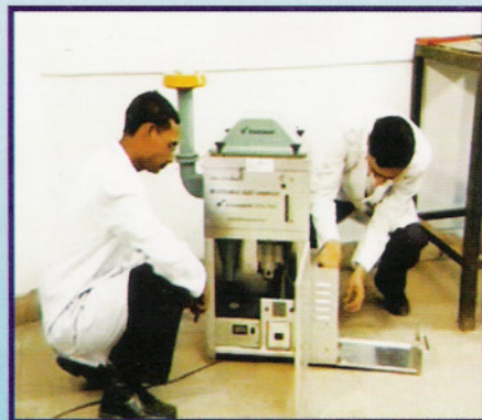
Ambient Air Sampling