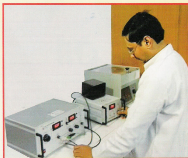
Tan Delta Of Oil