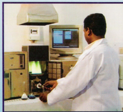
Water Testing Using Atomic Absorption Spectrophotometer